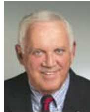
The Honorable Warren B. Rudman Stonebridge- International LLC