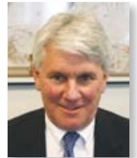
Gregory B. Craig Williams & Connolly LLP