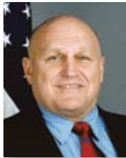
The Honorable Richard L. Armitage Armitage International