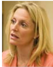
Lael Brainard Brookings Institution