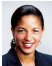
Susan E. Rice Brookings Institution