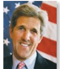
The Honorable John Kerry United States Senate