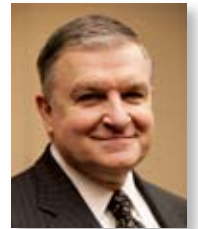
General Anthony Zinni, USMC (Ret.) DynCorp, International