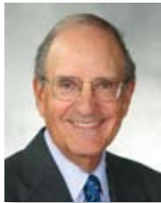
The Honorable George Mitchell DLA Piper, Rudnick, Gray, Cary