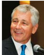
The Honorable Chuck Hagel United States Senate